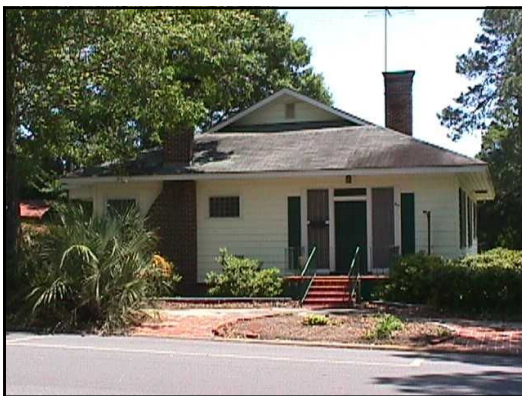
817 NORTH CENTRAL AVENUE

As you can see, God is at work and moving us forward to become the association that He wants us to be! Thank you for letting me be a part of this.